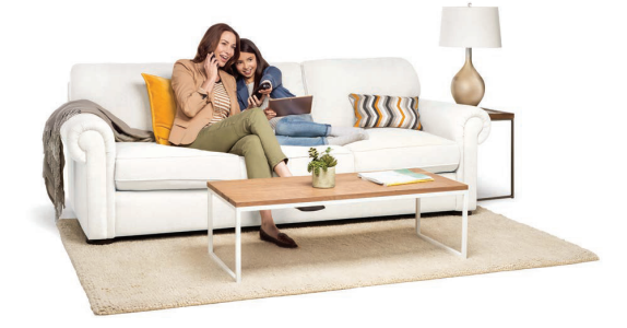
How much Internet are you using?